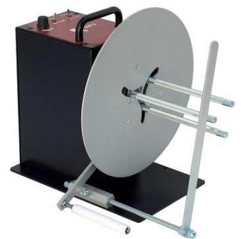
CAT-3-TA-ACH with APG

keep the unit from moving. The CAT-3 handles any rewind job and with its "HIGH" torque range can also power the LABELMATE S-100 or S-200 Label Slitters. Reliable, high quality and maintenance-free.