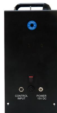
CAT-4 REAR PANEL