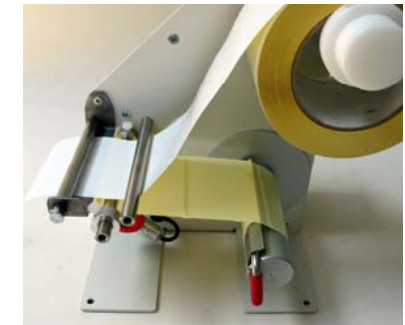
Label Threading Path

OPTIONAL LABEL COUNTER: The optional Label Counter will add one count to the displayed number for each label that is dispensed. This Option is available only factory installed in new units.