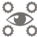
SCHULUNG & SUPPORT