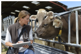
Animal Care & Veterinary products