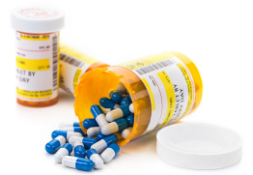
Pharmaceutical products, Body care & Medical Tests

Reduce the complexity, avoid obsolete labels, save time and money.