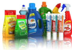
Home Care & Cleaning products