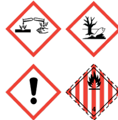
GHS & Chemical products